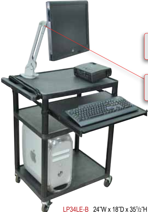
LP34LE-B 24"W x 18"D x 35½"H Wt. 32 lbs.