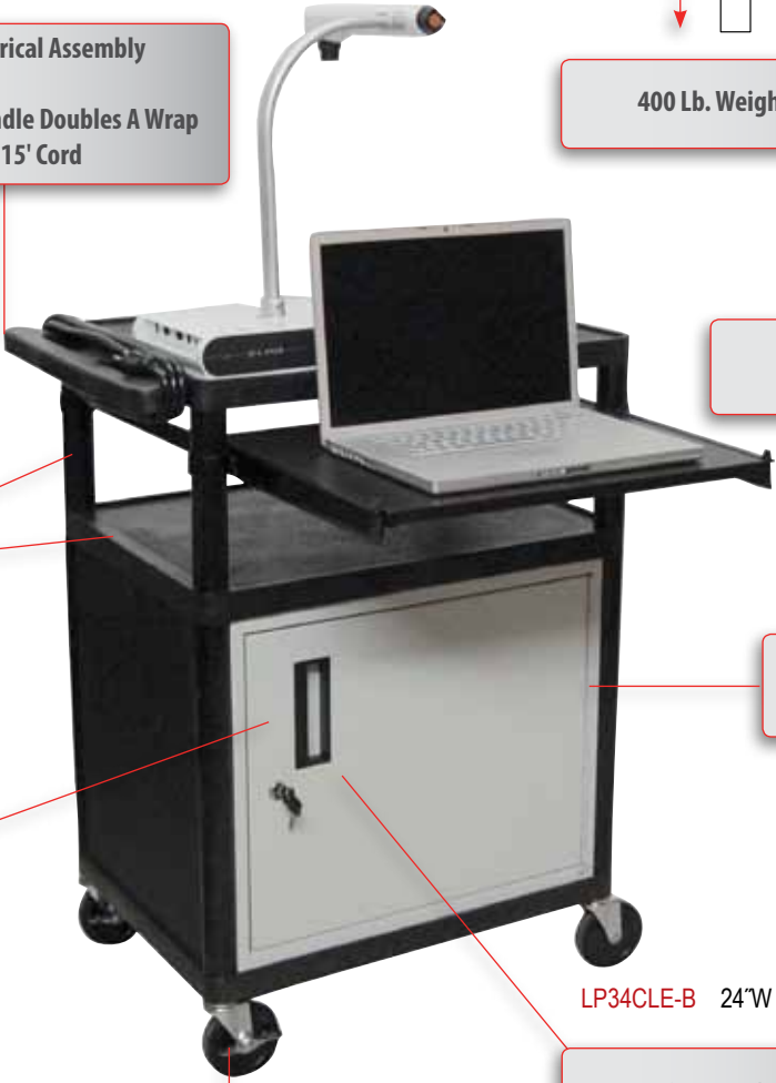
LP34CLE-B 24"W x 18"D x 35½"H Wt. 54 lbs.

Inside Cabinet Dimensions: 16¾"D x 23¼"W x 18"H Cabinet Door Opening Dimensions: 19"W x 15⅜"H