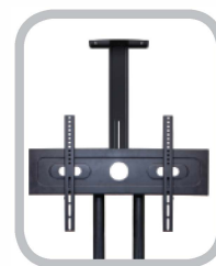
Optional Camera Mount