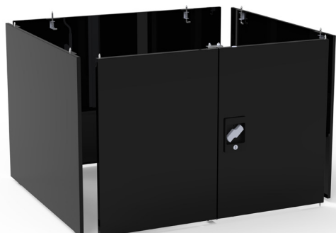
DTWS003 Optional Locking Cabinet

This feature-packed workstation will be a welcome addition to any commercial setting where durability and mobility are essential.