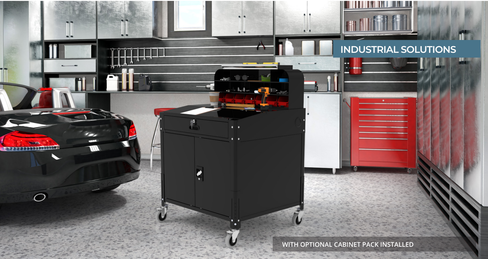
WITH OPTIONAL CABINET PACK INSTALLED