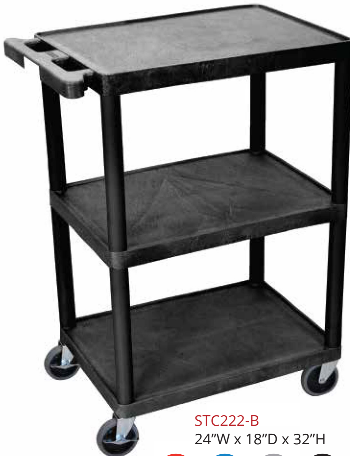
STC222-B 24"W x 18"D x 32"H